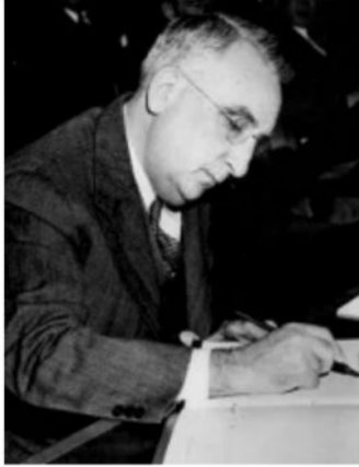
U.S. Treasury Secretary Fred M. Vinson.

"We can be thankful that the history we are now writing is not another chapter in the almost endless chronicle of war and strife. Ours is a mission of peace -- not just lip service to the ideals of peace -- but action, concrete action, designed to establish the economic foundations of peace on the bed rock of genuine international cooperation." -- Treasury Secretary Fred M. Vinson, signer of the Articles on behalf of the United States, speaking during the signing event in Washington DC on December 27, 1945.